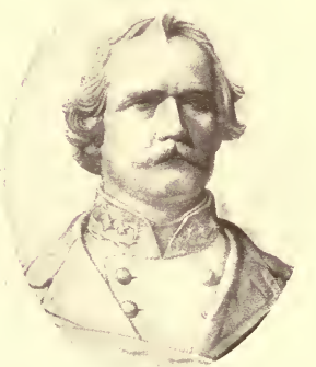
ALBERT SIDNEY JOHNSTON.